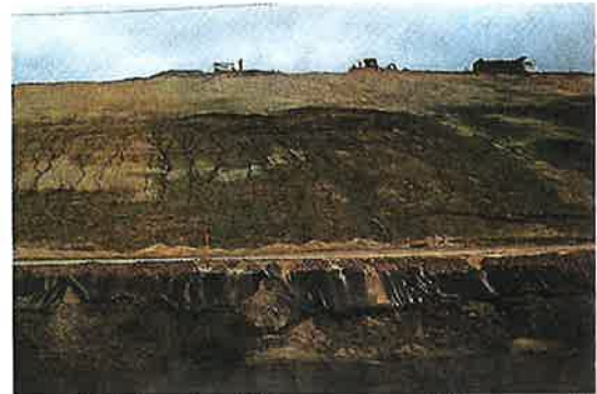
Photo 1. Slumps and erosion rill on a 2H:1V slope of a paper mill sludge landfill. From Richardson et al. (2004).